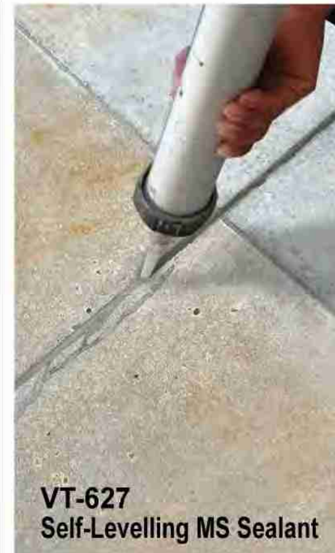
VT-627 Self-Levelling MS Sealant