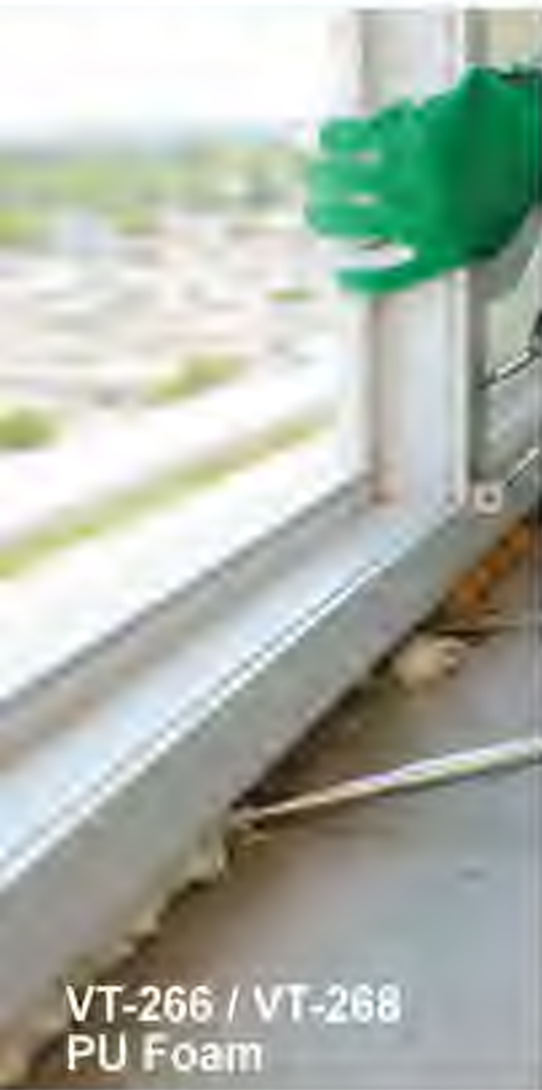
VT-266 / VT-268 PU Foam