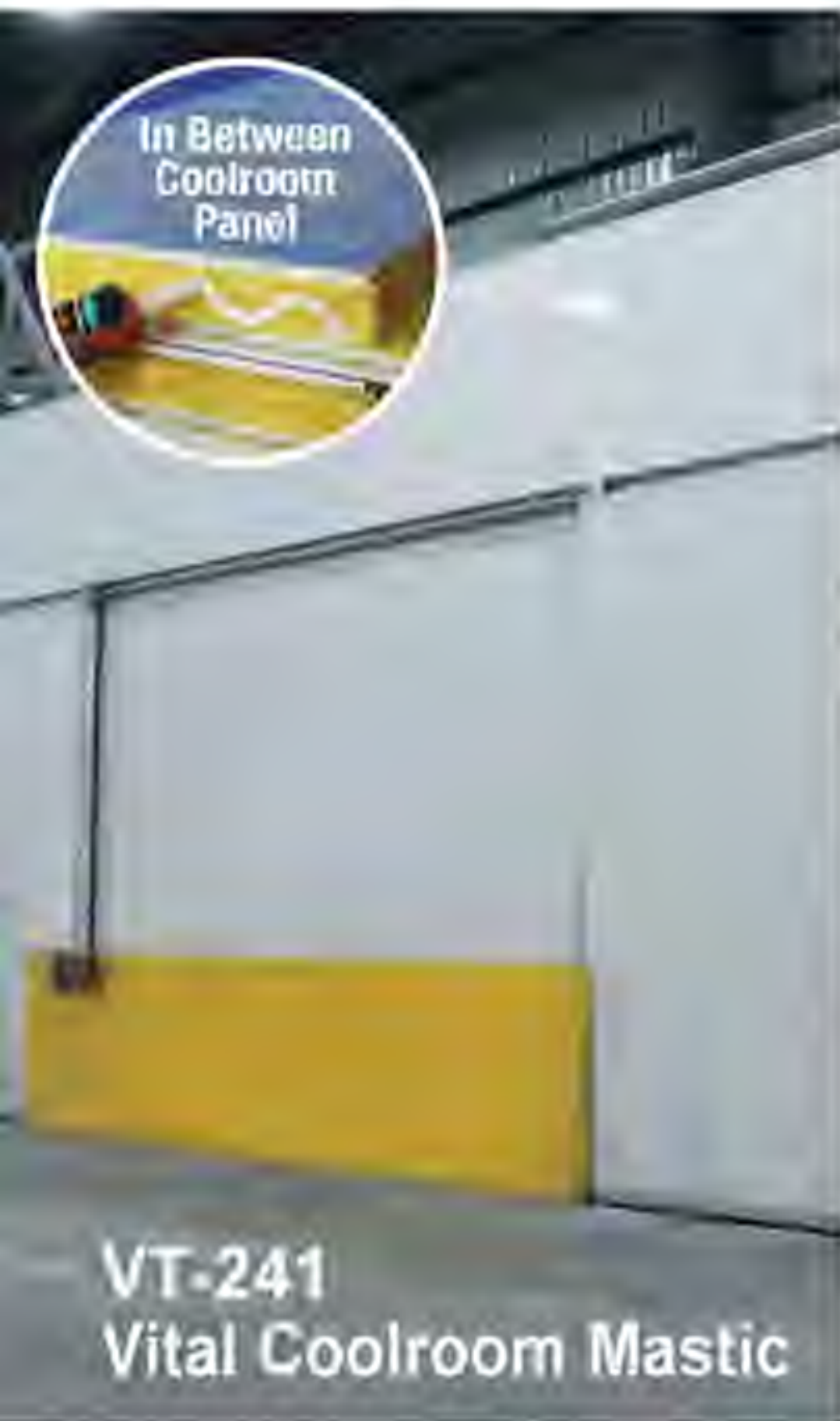
VT-241 Vital Coolroom Mastic