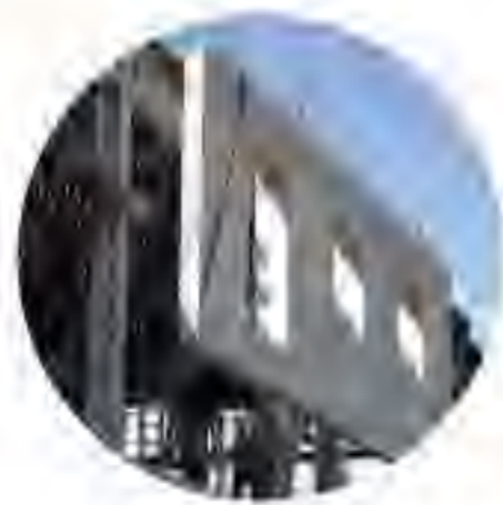
Construction (Door/Windows/Facade/Sanitary/ Plumbing/Flooring)