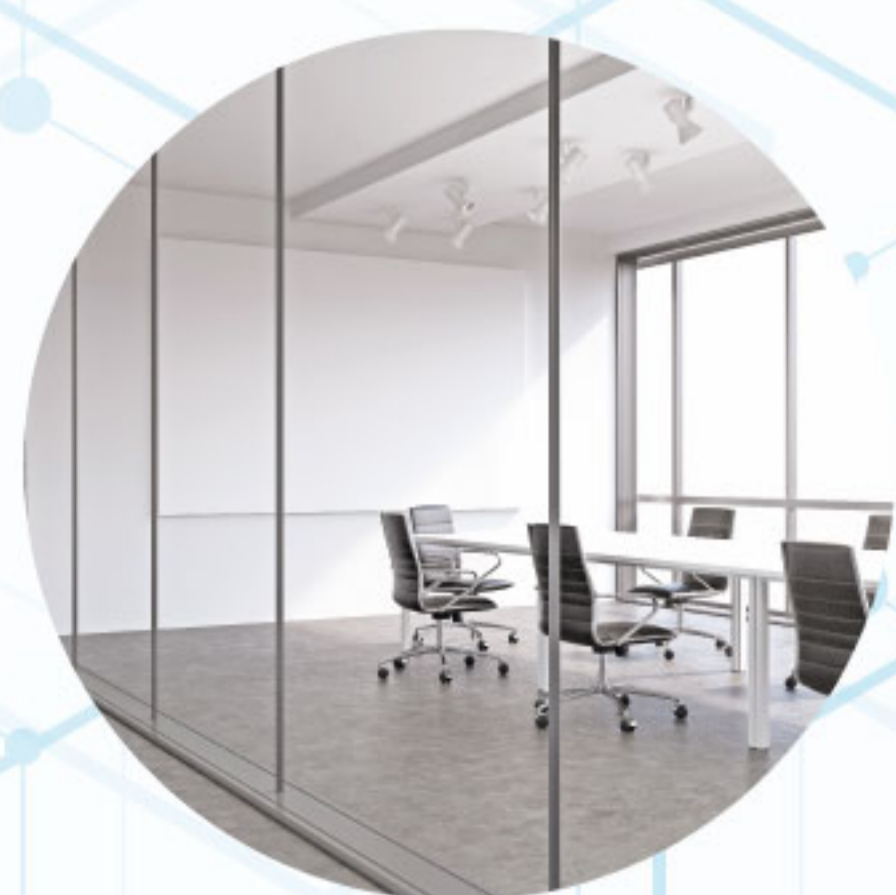
GLASS TO GLASS JOINT