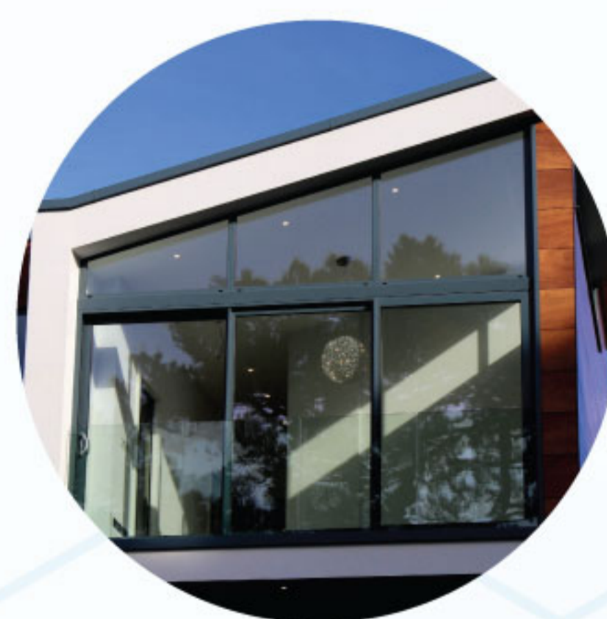
GLASS & ALUMINIUM