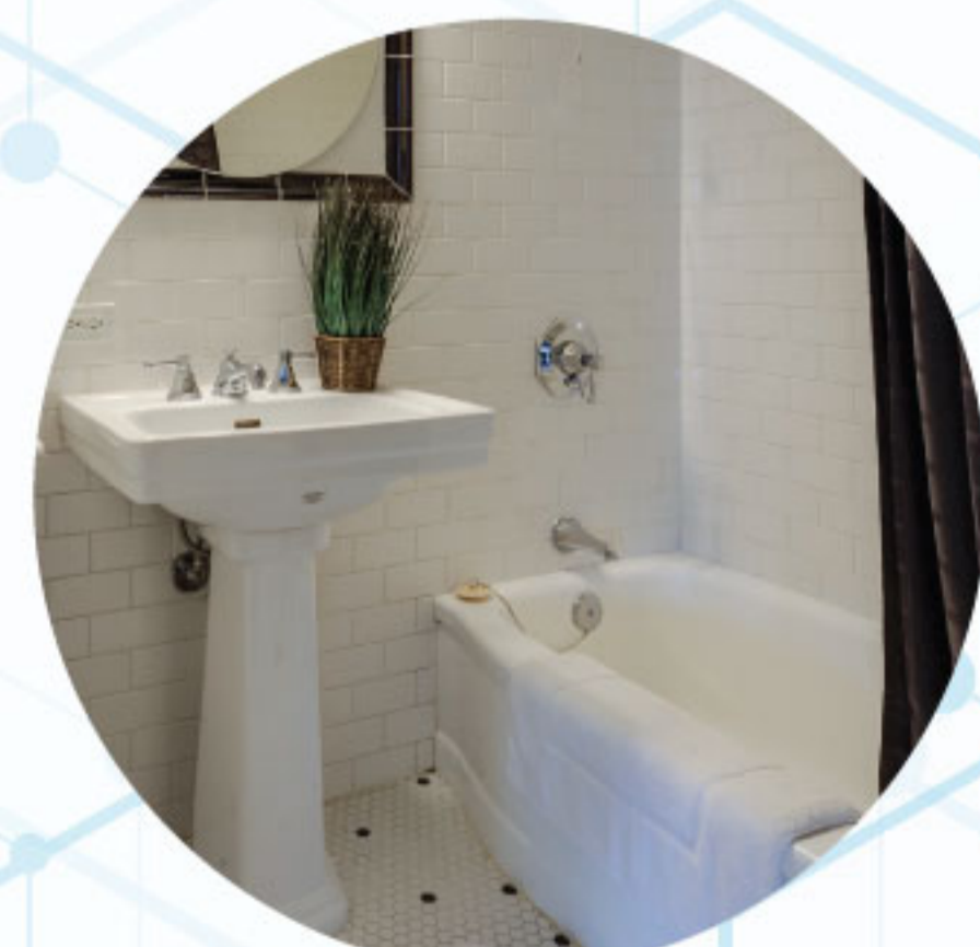
WASH BASIN & BATH TUB