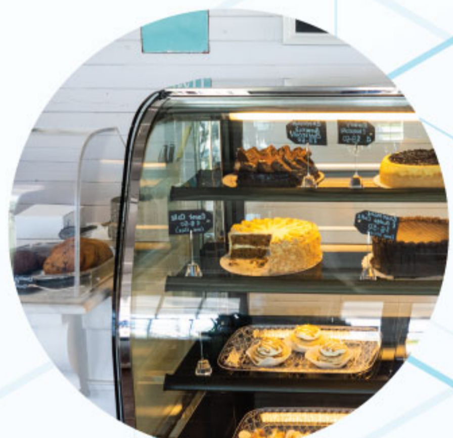
REFRIGERATED BAKERY DISPLAY