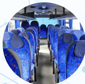
BUS SEAT CUSHION / CARPET