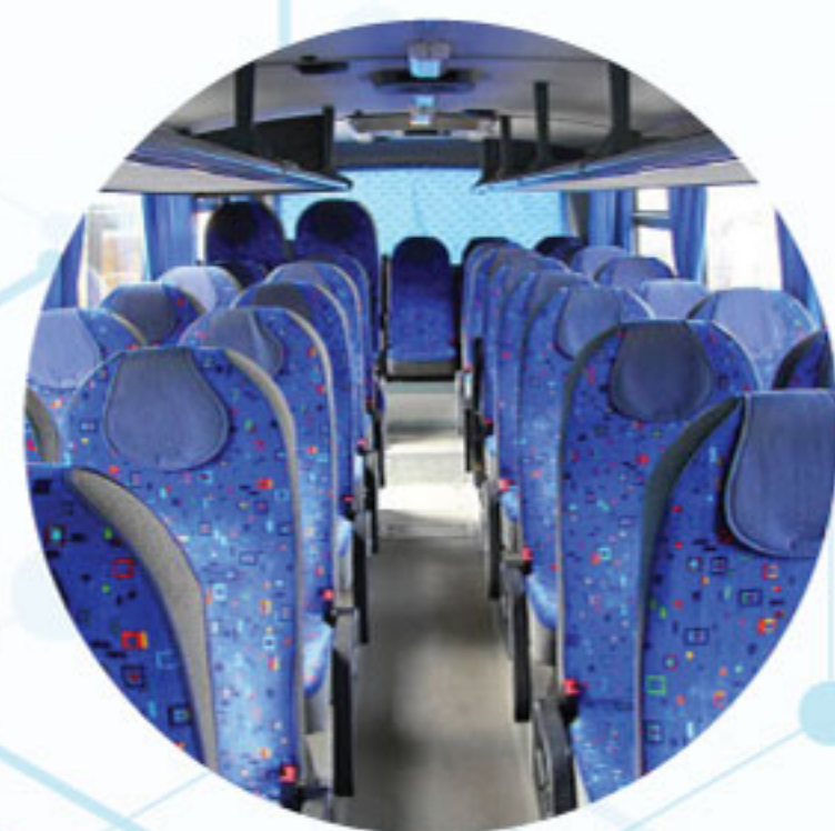
BUS SEAT CUSHION / CARPET