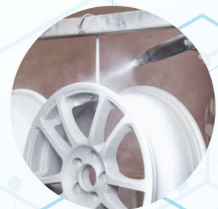
POWDER COATING HOOK