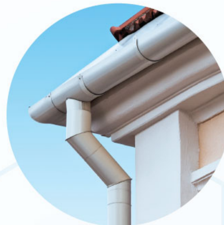
ROOF & GUTTER