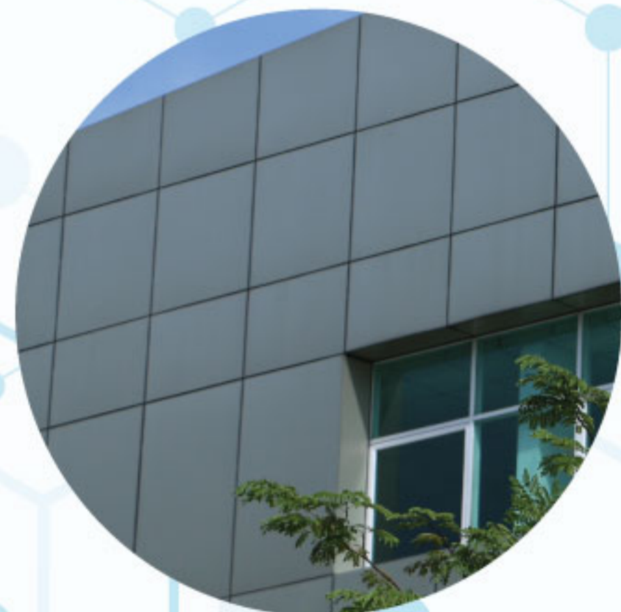
ALUMINIUM COMPOSITE PANEL