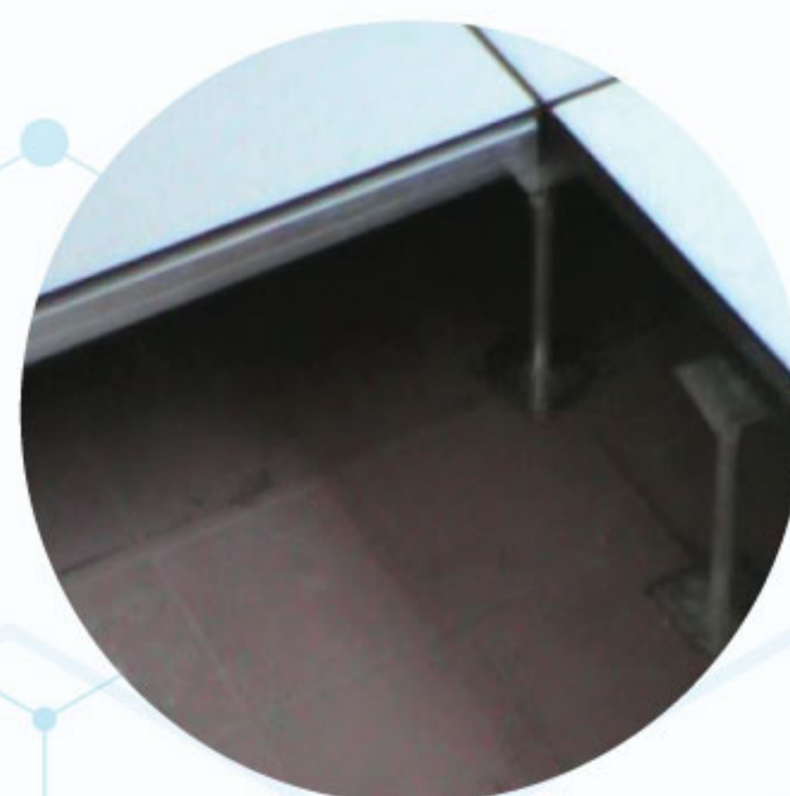
RAISED ACCESS FLOOR