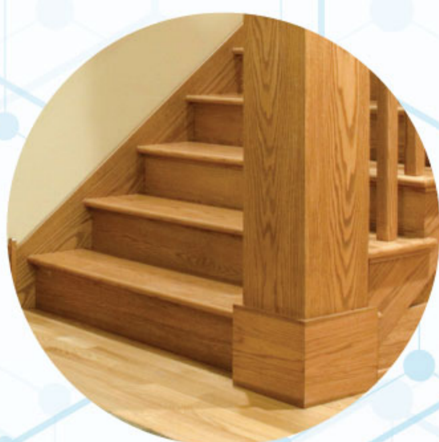
VERTICAL BOARDS AND PANELS