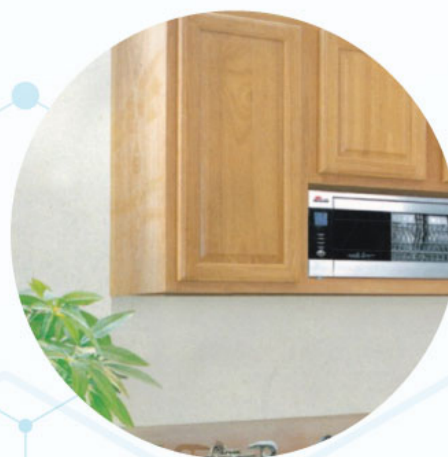
GAP BETWEEN WALL & CABINET