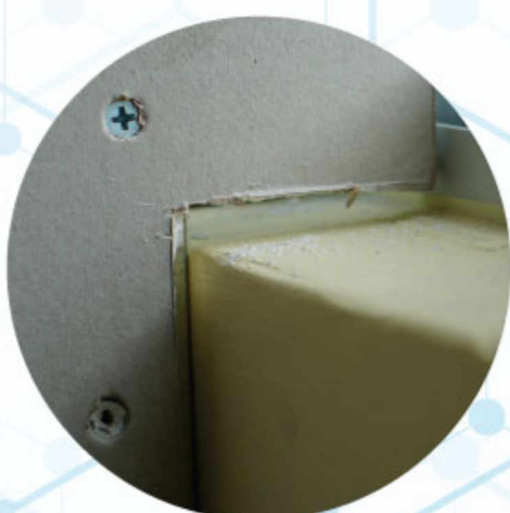
PARTITION TO WALL GAP