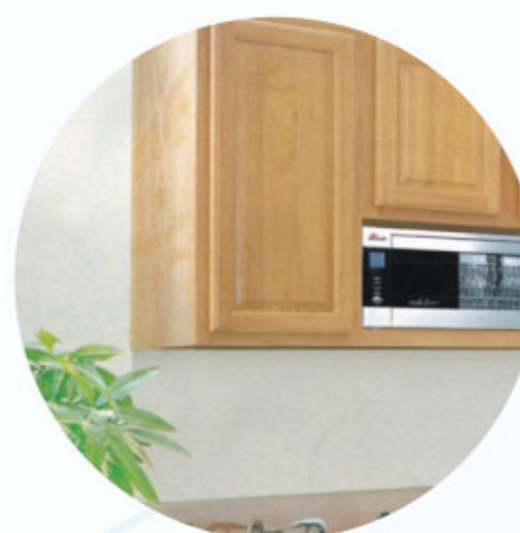
GAP BETWEEN WALL & CABINET