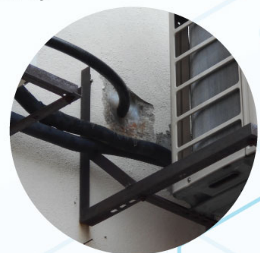
PENETRATION GAP SEALING