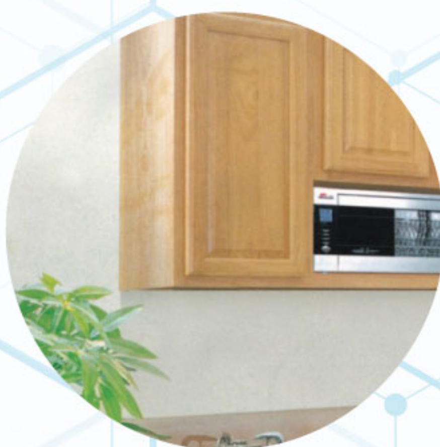
GAP BETWEEN WALL & CABINET