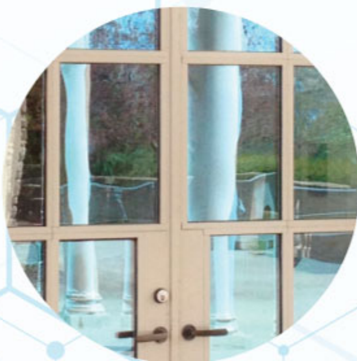
MULLIONED DOORS & WINDOWS