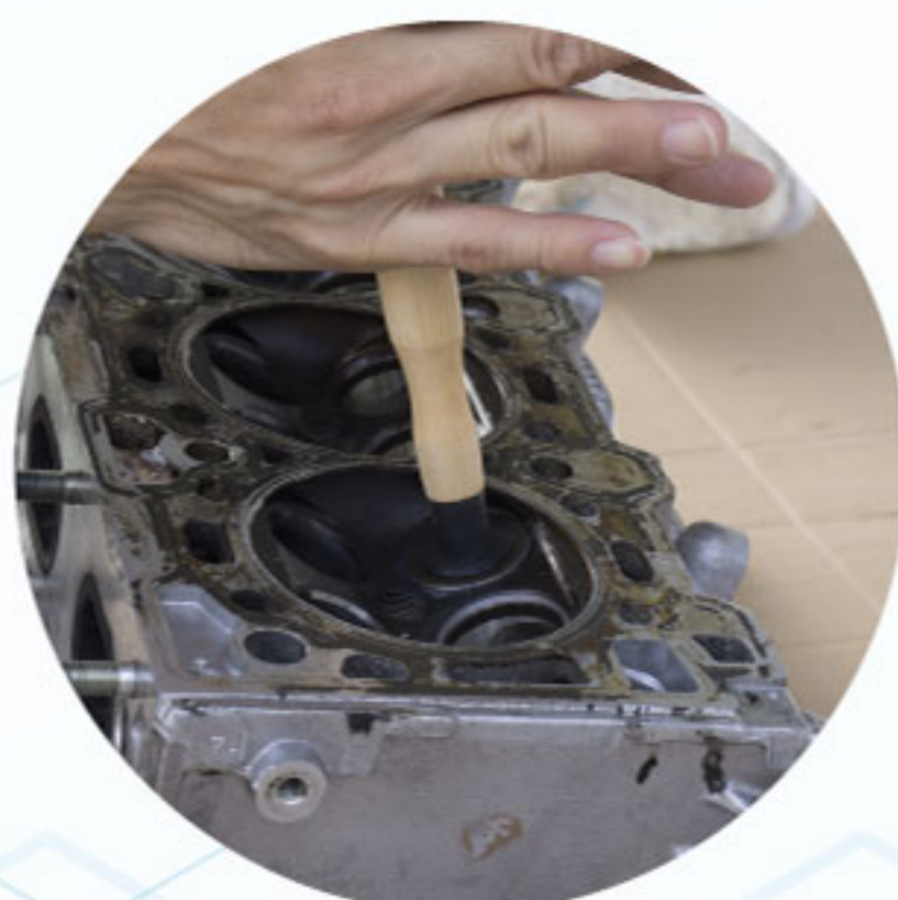
VALVE SURFACE DEFECTS & CARBON DEPOSITS

VITAL TECHNICAL SDN. BHD. (No.: 589221-K)